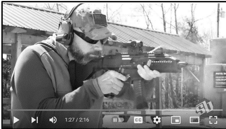
SB Tactical describes this technique as sternum mounting.

The Stabilizing Brace Rule also explains that such use of particular stabilizing braces as shoulder stocks is not mere happenstance, and it is not solely because of the habits of particular purchasers. Rather, these specific “braces” are marketed for this precise use, as is evident in a manufacturer’s video from SB Tactical, which the Rule cites. 14 That video demonstrates various “techniques” for using the “brace,” including the two instances in the screenshots below that clearly illustrate the pistol’s use as a rifle: