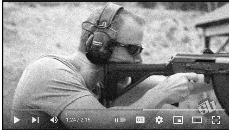
SB Tactical describes this technique as “cheek welding.”