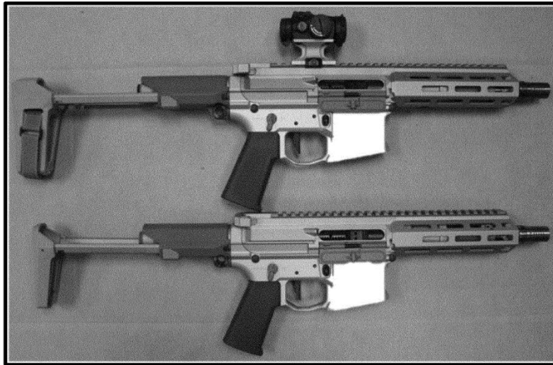
Pistol with attached “stabilizing brace” (top) compared to rifle (bottom), both marketed by the same company

of contact between the gun and the shooter. But beginning in 2014, ATF “began to see ‘braces’ being used to fire weapons from the shoulder and new ‘brace’ designs that included characteristics common to shoulder stocks.” 8 The photograph below, included in the Rule, demonstrates the way in which certain new “stabilizing braces” were in fact being used to market as “pistols” what were functionally short-barreled rifles: