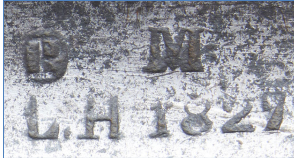
Figure 3 : Massachusetts Proof Mark. 20

the Commonwealth. 19 For example, a proof mark from the 1820s is pictured below, displaying the prover's initials ("LH"), the year of proving (1827), a "P" for proved, and an "M" for Massachusetts: